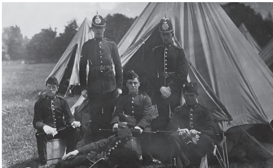
Oxford University Rifle Volunteers, 1890s.

Front cover image: Cambridge OTC line up at Mytchett Camp, Hampshire, August 1914. Both the university and school contingents of the OTC spent that month wondering what might happen to them - and the world they knew.