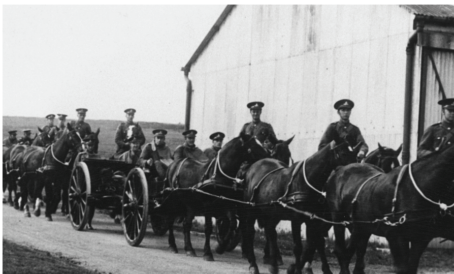
Post-war Edinburgh University 'Battery' with 18 pounders, still horse-drawn, at Redesdale Camp, Northumberland, 1934.