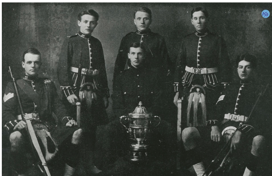
Aberdeen OTC Rifle Team.