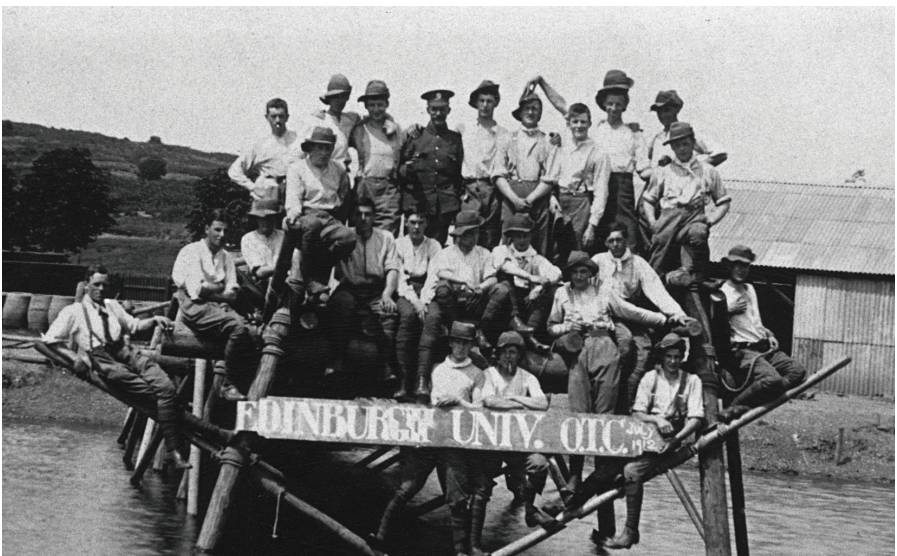
Edinburgh Engineer Detachment test their bridging skills at Chattenden, Kent.