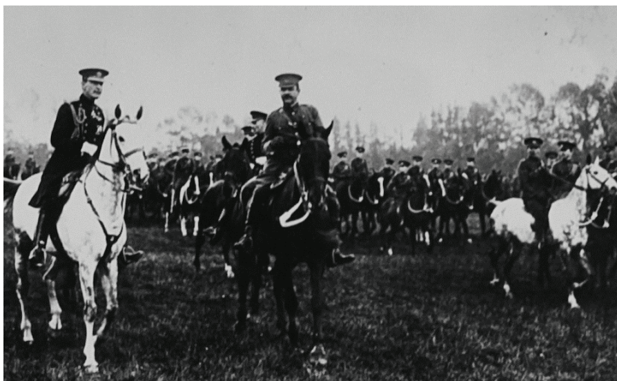
Inspection of Oxford OTC Cavalry Detachment.