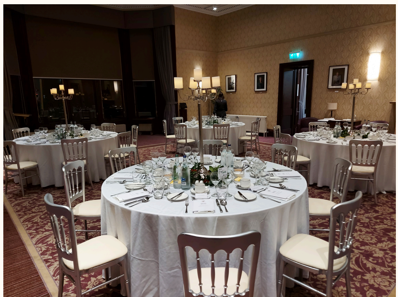
Edinburgh Napier University, Rivers Suite