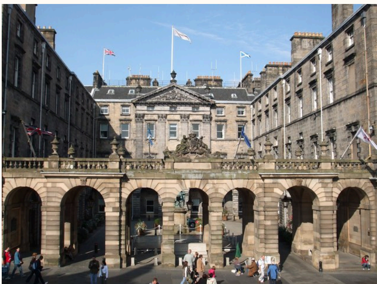
Edinburgh City Chambers

Further details on registration and the full programme will follow shortly. We look forward to welcoming you to Edinburgh.